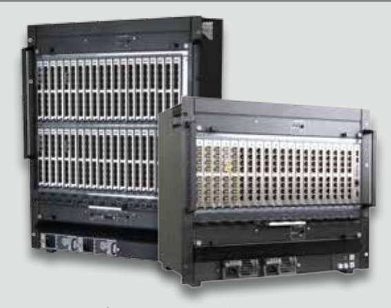
The Draco tera matrix system. Available in a range of sizes from 8 to 576 ports.