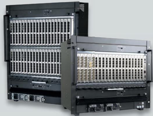
The Draco tera matrix system. Available in a range of sizes from 8 to 576 ports.