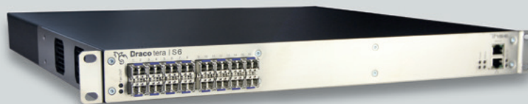
The Draco tera | S6. Available in a range of sizes from 8 to 80 ports.