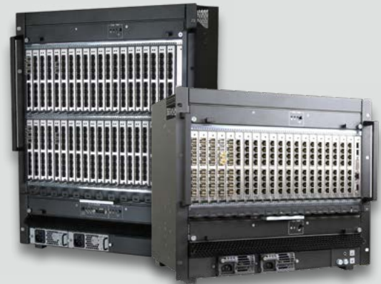
The Draco tera matrix system. Available in a range of sizes from 8 to 576 ports.