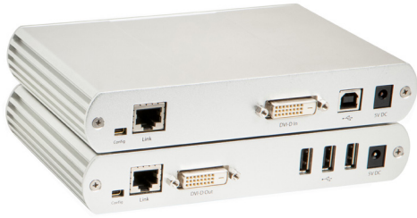
Rear views of LEX (top) and REX (bottom)