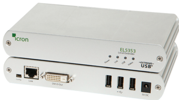
LEX (Local Extender) front view

The EL5353 KVM extender system features the latest and most robust HD video and USB extension technology from Icron. The EL5353 extends both DVI and USB 2.0 applications up to 100m over a single CAT 5e/6/7 cable.