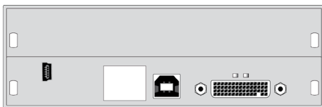
L482-2SHC L482-2SHS L482-2SHX