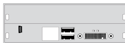
R482-2SHC R482-2SHS R482-2SHX