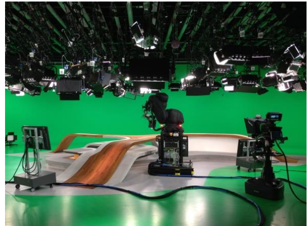
ZDF newscast studio

The collaboration between IHSE and ZDF has been very constructive from the very start. Requests and requirements made by ZDF for new features were received well, developed and transformed into practical solutions.