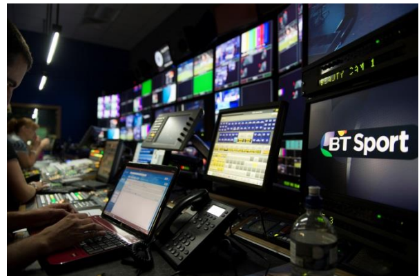
BT Sport studios