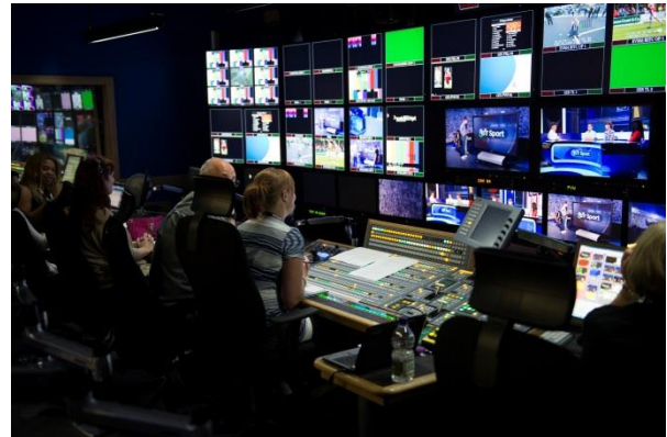
BT Sport studios

and then disconnect the extender cards. When reinstalled later in its final location, the switch automatically identifies the equipment and reconnects. Simple connection between the two Draco tera chassis to form one large, virtual matrix also provided additional functionality to the system.