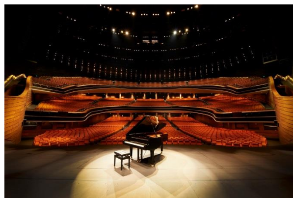
The Star: theater hall