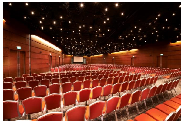
The Star: gallery

The sheer size of the complex – covering 38,000 m 2 and 9 floors – means that some data has to travel in excess of the normal maximum distance for HD video signals on copper cables of around 140 meters. BES took advantage of the ability of the Draco tera system to mix fiber outputs alongside Cat X copper, allowing connection to be made to workstations up to 1 km away from the switch using multi-mode fiber.